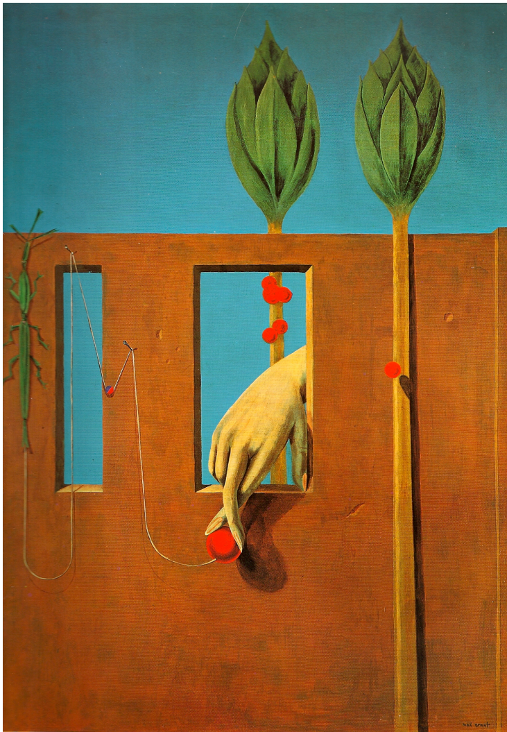
Figure 1 Max Ernst: At First Clear Word . Oil on plaster on