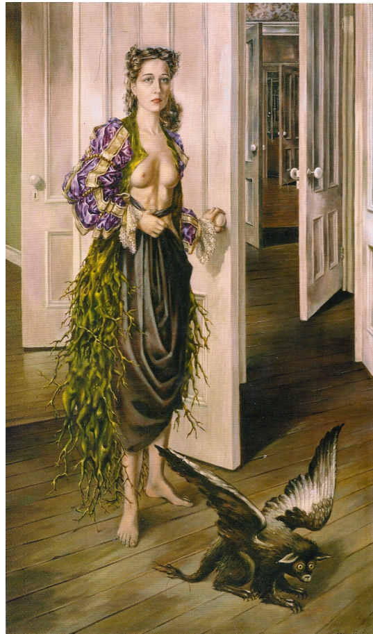
Figure 2. Dorothea Tanning: Birthday. Oil on canvas. 1942.

In 1942, when Tanning turned thirty, she painted a self-portrait that became not only an essential piece of Surrealist artwork, but also proved to have significant impact on the course of the rest of her life, both personal and professional. In the painting, Tanning wears only a purple ruffled masculine Shakespearian jacket on top, leaving her bare breasts exposed. Perhaps