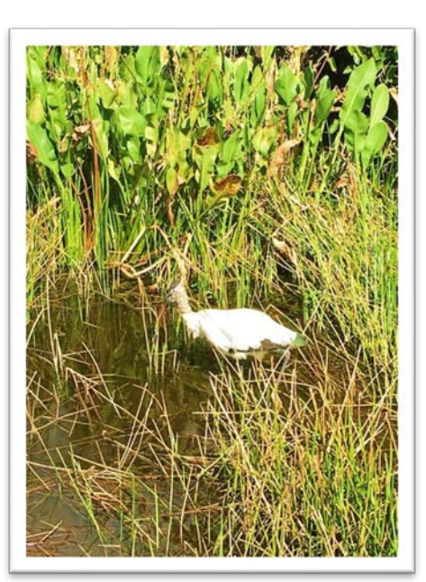
Green Cay Nature Preserve